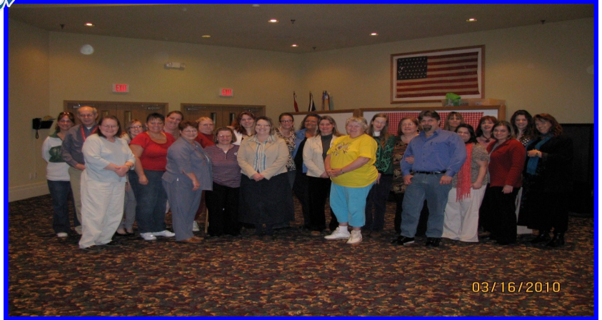
Graduating class of 2010